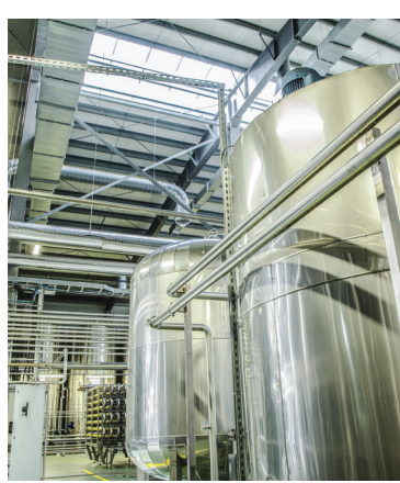
Food & Beverage