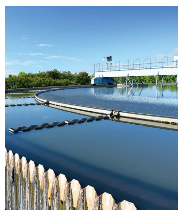
Water & Wastewater