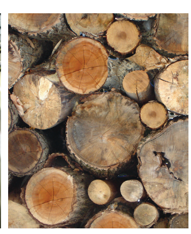
Pulp & Paper